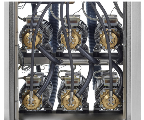
Easy service and maintenance: Time-saving access to motor pumps and other vital parts from top or front of the machine