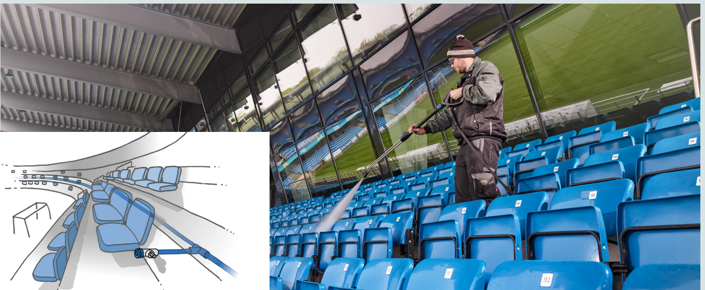
Cleaning of spectator area and seats in a stadium. Cleaning the spectator area after a game or an event can be difficult. In this example the stationary high pressure washer system (SC DELTA) enables multiple operators to clean fast and efficiently at the same time