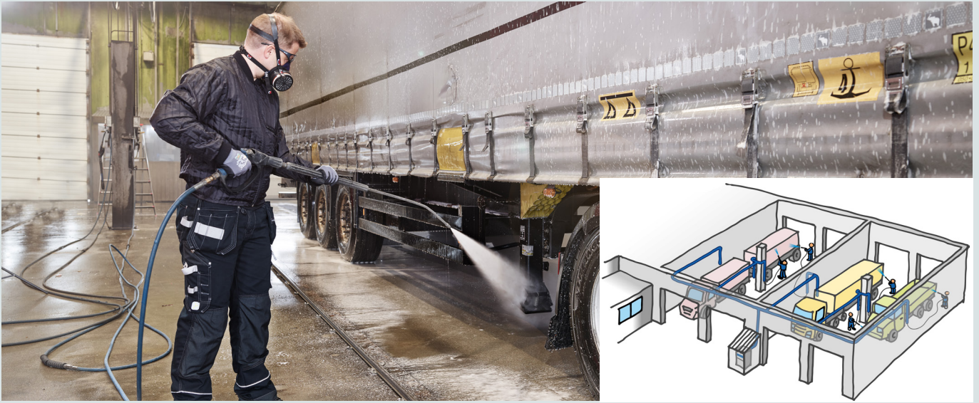
Large trucks wash area. Main applications being truck wash, pre-wash & cleaning of hard to reach areas as well as cleaning the inside of trailers. This company has 4 wash bays with up to 6 operators working simultaneously